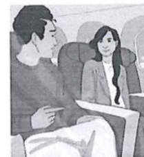
(Adapted from C21 Smart)

"Who will I sit next to? Will they be interesting or will they be really (1) _____?" Are these the questions that you often ask yourself before a (2) _____? But that's all going to change! An airline company has introduced a new system (3) _____ 'Meet & Seat'. Now you can choose your 'next-door neighbour'. When you book your tickets, you can show your social media profile (4) _____ everyone on the plane. You will also see everyone else's profile. Then you can choose who you want to sit next to. If you want to talk about work and (5) _____ business contacts, look at people's professional network profiles. And if you prefer (6) _____ fun and chat about travelling and shopping, look at their social network profiles!